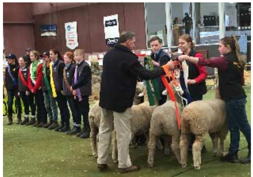
Junior judging at the 2016 ASBA Show.