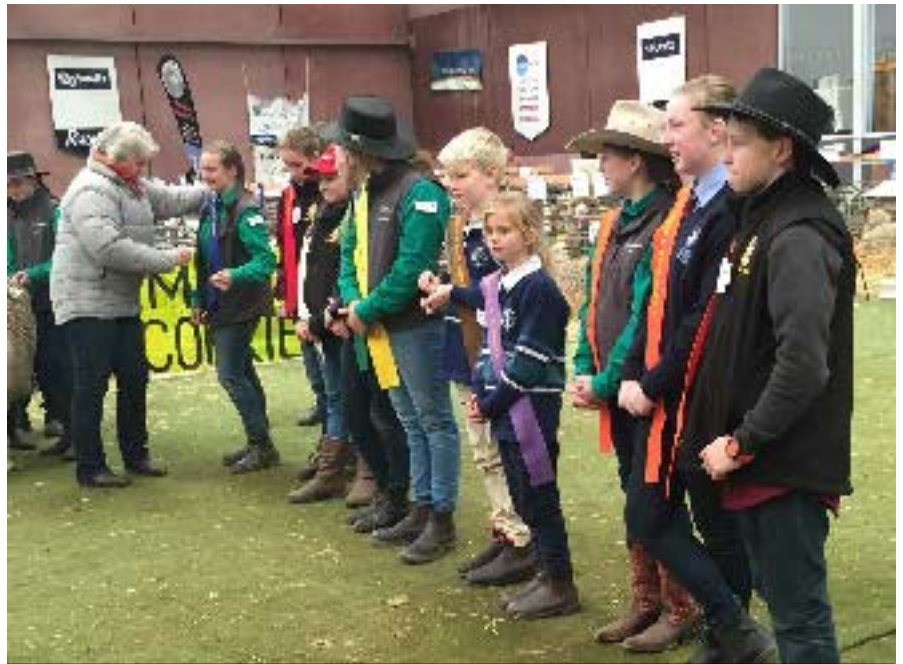
Junior judging at the 2016 ASBA Show.