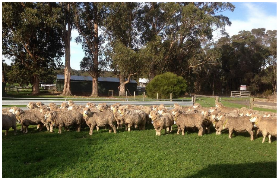
Inlet views stud ewes wearing neck chains for identification at lambing.