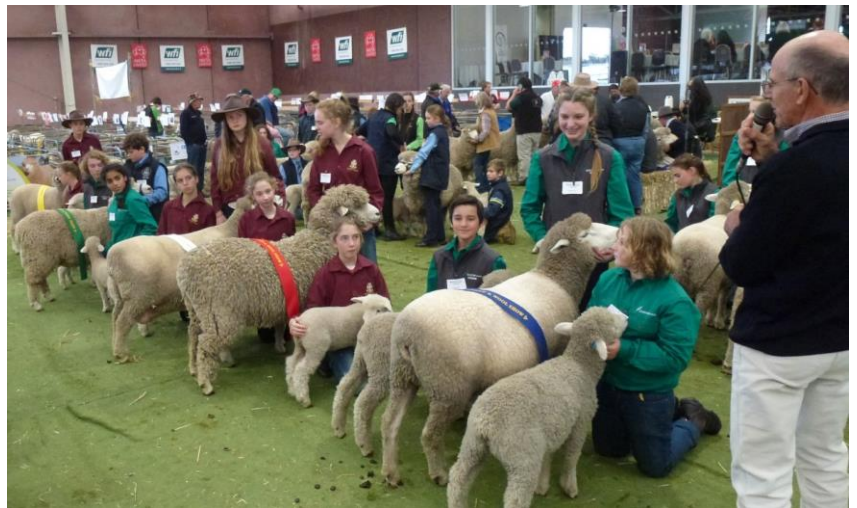
School judging at the 2015 ASBA Show.