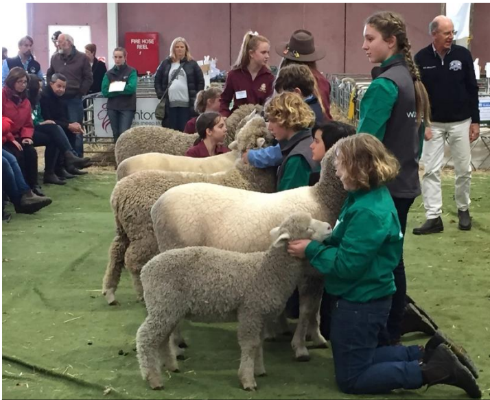
School judging at the 2015 ASBA Show.

on computers. UNE presented each student with a pen complete with a USB drive concealed on the end. As you can imagine they were a treasured possession!