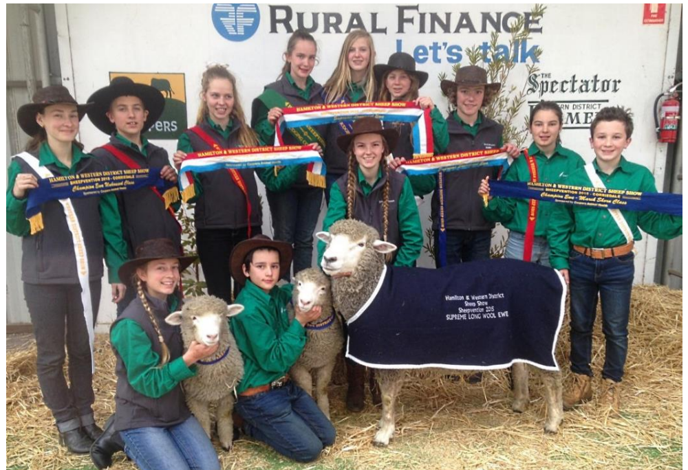
Woodleigh School students with the supreme interbreed longwool ewe at Hamilton Sheepvention, 2015.