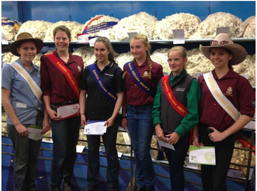
Competitors in the junior judging at the Royal Geelong Show, 2015.