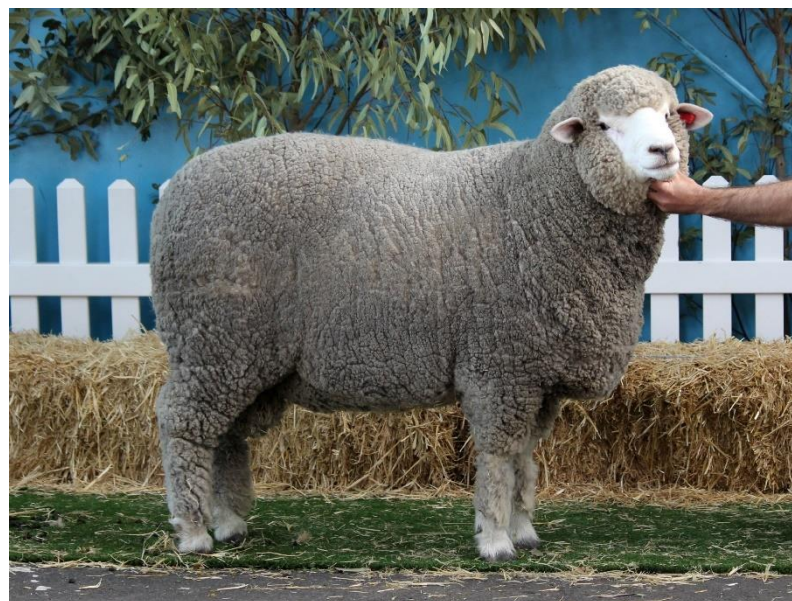
Sweetfield's "Mack", the 2015 Royal Geelong Show champion ram, supreme champion Corriedale, interbreed champion longwool and winner of the Alan and Yvonne Deppeler Memorial Trophy.

Most successful Corriedale exhibitor Sweetfield